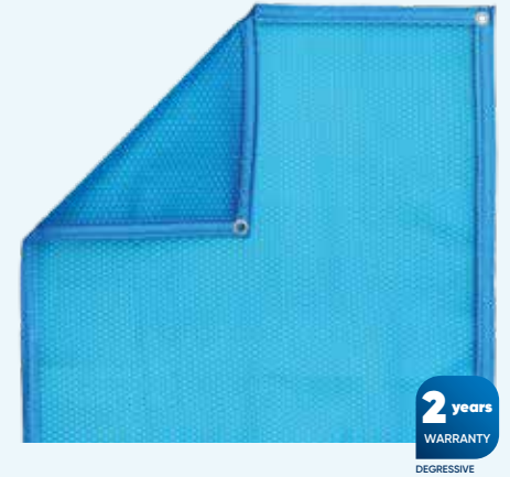
BLUE BLUE - 400 400 microns bubble cover, blue colour.